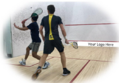
On the Exhibition Court Tin Evening of the Event