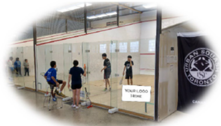
At our UST Facility Various Locations